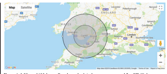
Figure 1. A 50- and 100-km radius, here depicted on a map around Cardiff, Wales, can help practices establish their target market.

To find your target area, use a map circle tool such as the application from Map Developers (http://bit.ly/0519Solar). If you are in a metropolitan area, plot a circle around your location with a 50-km radius (roughly equivalent to a 1-hour drive). On the other hand, plot a 100-km radius